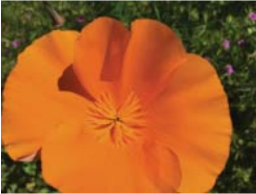
The delicate orange petals of a California poppy are elegant.